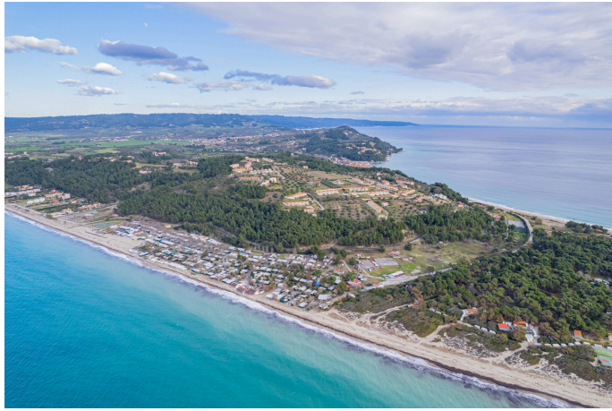
University Camping AUTH Possidi, Chalkidiki, Greece